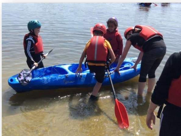
Outdoor Adventures Reward Trip