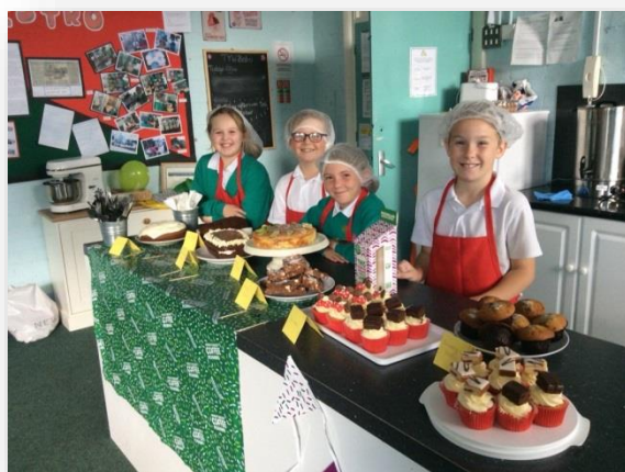
Cakes on sale @ The Bistro