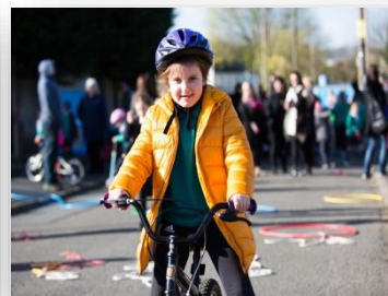
School Street Event