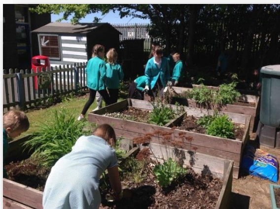
Planting in the garden

Our outdoor areas are well resourced and nearly all classes have direct access to the outdoors. We have our own garden area that is equipped with raised beds, ample seating and a range of trees and foliage. Several members of staff are Forest School trained and run weekly sessions for pupils across the school. We link closely with the local allotment who are a great resource and are a fantastic support to the school. Our pupils visit regularly and have helped to win many awards. We have invested heavily in our outdoor play provision. Each class in Progression step 1 and 2 has a large, sheltered area and further developments of the outdoor areas are planned for this year.