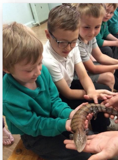
Wild Animal Workshop