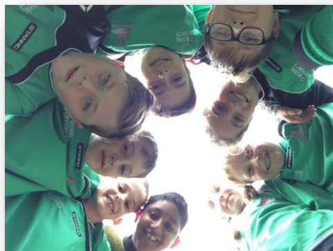
Team sports - team effort

For health and safety reasons trainers MUST be worn for games lessons. Jewellery should not be worn to school. If it is worn by mistake to school your child will be expected to remove it and give it to their teacher for safe keeping. Studs must be covered up with plaster and long hair must be tied back.